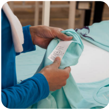
Total Quality Control

advanced inspection systems and skilled craftsmanship. The result consistent quality, flawless finish, and superior comfort in every piece we deliver.